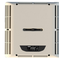
Inner console with touch screen. Dimmable ambient LED